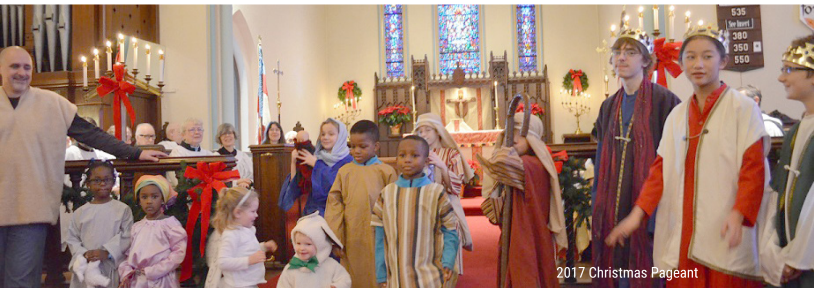
2017 Christmas Pageant

St. Luke's is a place where people are constantly learning, growing, and experimenting. Nobody expects their priest to be perfect, just as nobody else in the congregation is perfect. We aim to have grace for one another's mistakes and to learn from our experiments and mishaps.